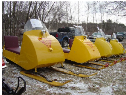
ANOTHER SNOFEST PHOTO